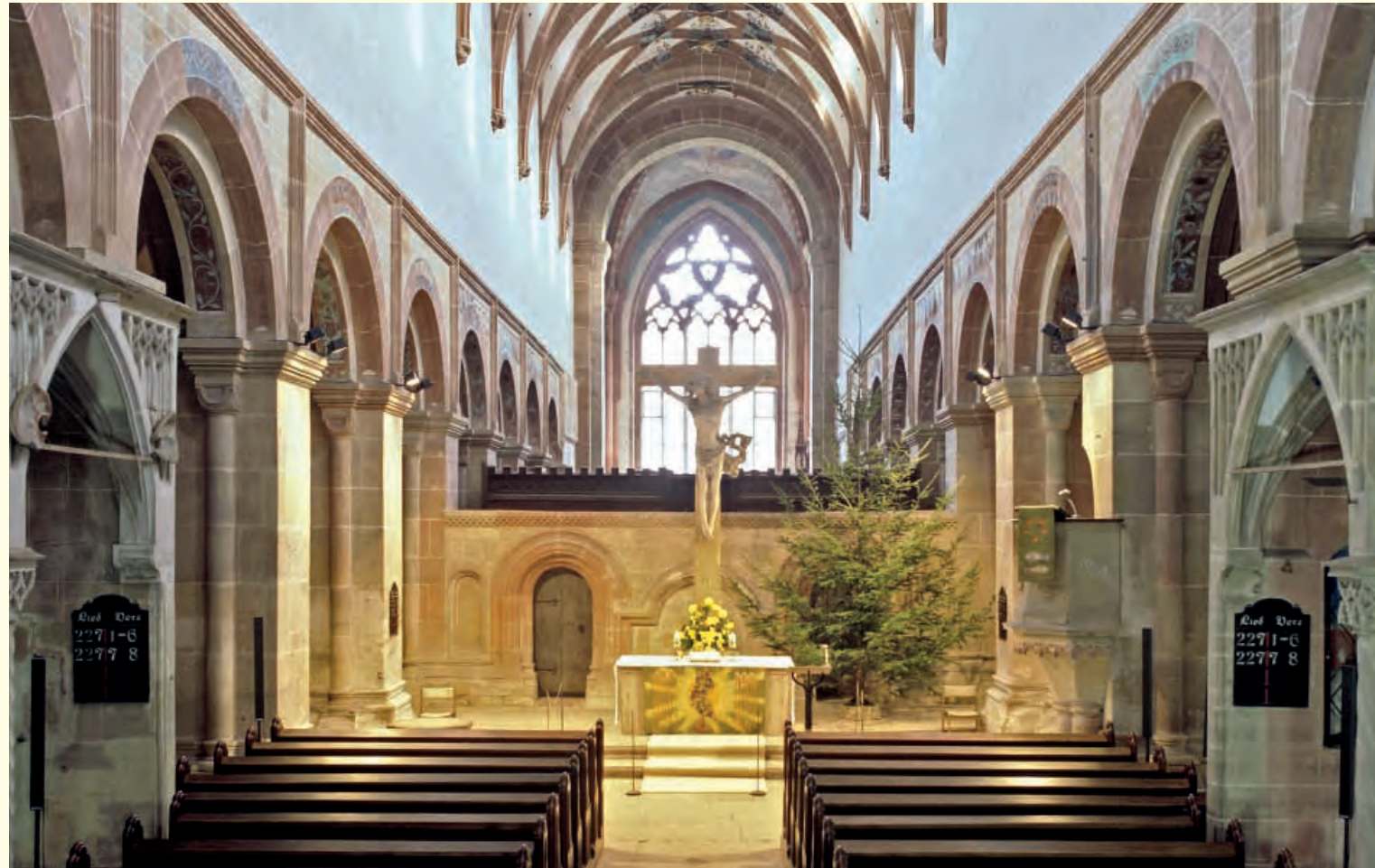
Interior View of the Church

The monastery in its entirety is a harmonious work of art presenting a whole array of highlights: the so-called “paradise”, the church foyer, is a structure of special significance, as is the monks’ refectory as well.