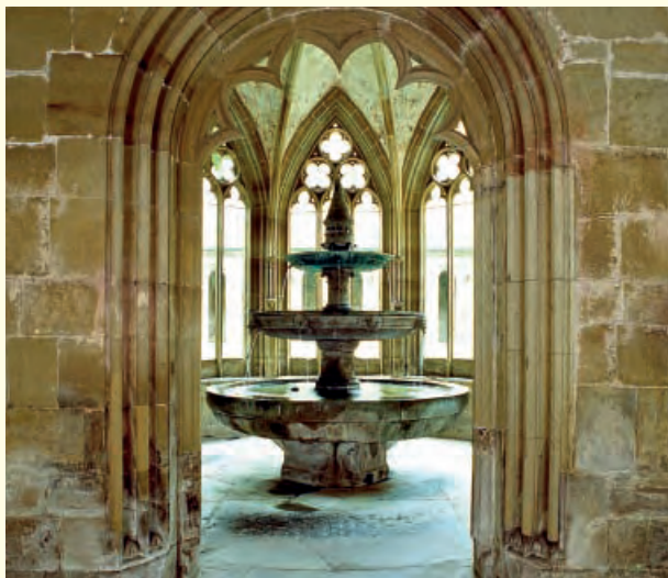
The Well House

Under the motto “Ora et Labora”, the Cistercian monks rose to prosperity in Maulbronn. Descend into the stone vaults where the monks stored their wine. Take a close look at the centuries-old stone blocks, expertly hewn by the monastery’s skilful inhabitants.